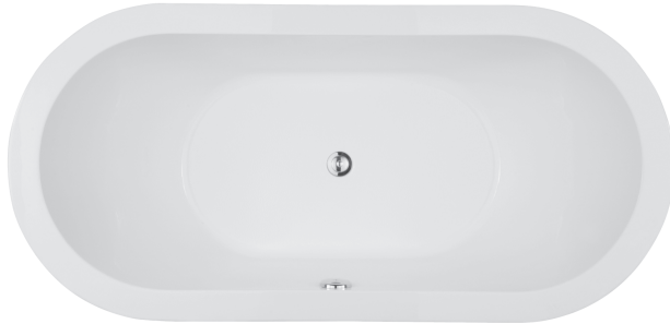
Tub must be set in Mortar Base