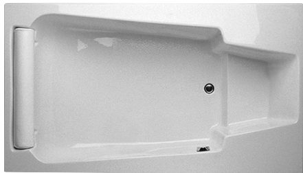
Tub must be set in Mortar Base

Microban antibacterial protection (Acrylic only) Extra high density fiberglass Flange-molded (Acrylic only) Flange-galvanized Waterfall spout (Acrylic only) Skirt Custom jet & pump locations Plated metallic finish Additional directional jets Swirling, rotating, or jumbo jets